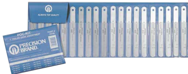
Manufacturer #19740 SAE Set